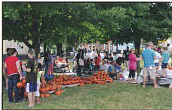
Above—Large crowd gather for pumpkin painting.