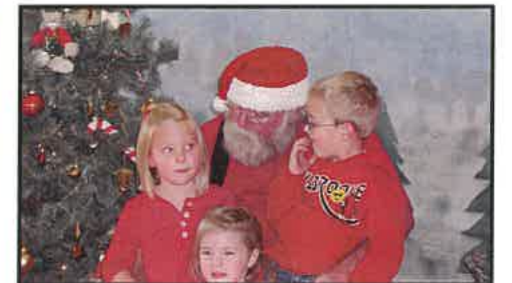
Above—Boys and girls meet with Santa Claus.

On December 6, 2014, from 1:00—3:00 p.m., the Jeffers Bend Steering Committee and Pennyriple RC&D Area Council, Inc. hosted Christmas at the Bend, in which hundreds of young people, parents, grandparents and friends visited Jeffers' Bend to take photos with Santa Claus. The participants also had the opportunity to enjoy apple cider, hot chocolate, and cookies; and make crafts and Christmas Cards for nursing homes.