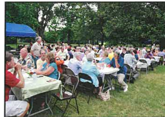
Above—Over 180 people gather for Dinner by the River.