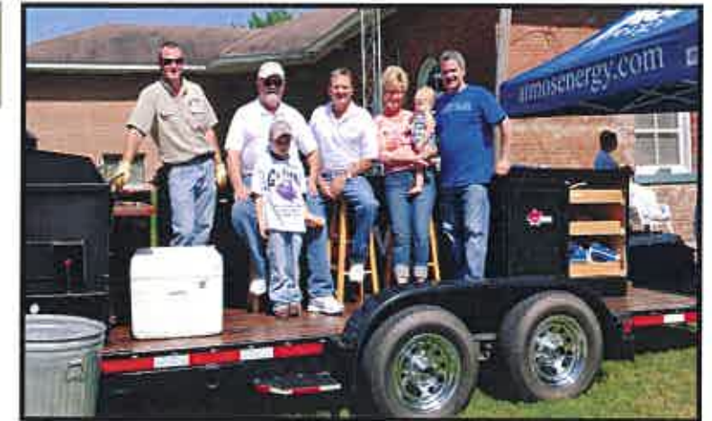
Above—Cooking Crew from Atmos Energy.

The fishing event is supported by 60 plus sponsors, including Pennyriple RC&D Area Council, City of Hopkinsville, Hutson Implement Company, Christian County Conservation District, BB&T Bank, Fort Campbell Federal Credit Union, Heritage Bank, Pennyriple Allied Community Services, United Southern Bank, Christian County Fiscal Court, Kentucky Department of Fish and Wildlife Resources, Housing Authority of Hopkinsville, Hopkinsville Water Environment Authority, Pioneers, Inc., etc.