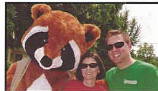
Above—J B Raccoon, the mascot for Jeffers