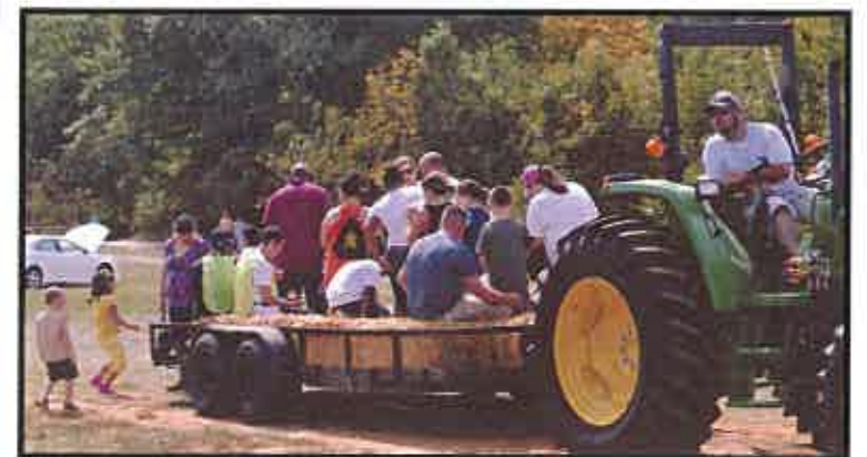
Above—Transportation provided by Hutson Implement Company (tractors) and City of Hopkinsville (wagons).

The 2015 fishing event will involve about 650 kids and 550 adults coming together at Jeffers' Bend in Hopkinsville for three hours of family fun in which youngsters ages 3 to 15 fish for prizes. The prizes will be awarded in the four age groups of 3-5, 6-8, 9-11 and 12-15 for the smallest, largest and most fish caught. The prizes will include 22 new bicycles, fishing equipment, outdoor chairs, etc.